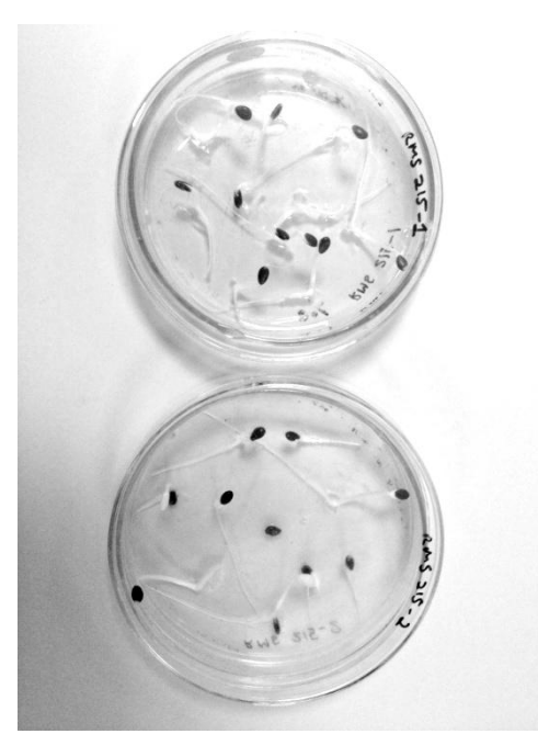
Fig. 1. In vitro germination of seeds on 0.8% agar after pre-treatment (T2).

Twenty seeds each of the 30 accessions were manually scarified using sandpaper, soaked for 48 hours and incubated on 0.8% agar at 30 °C and germination data was observed and recorded daily. This was done in order to identify a smaller number of accessions with high germination efficiency for the salinity screening.