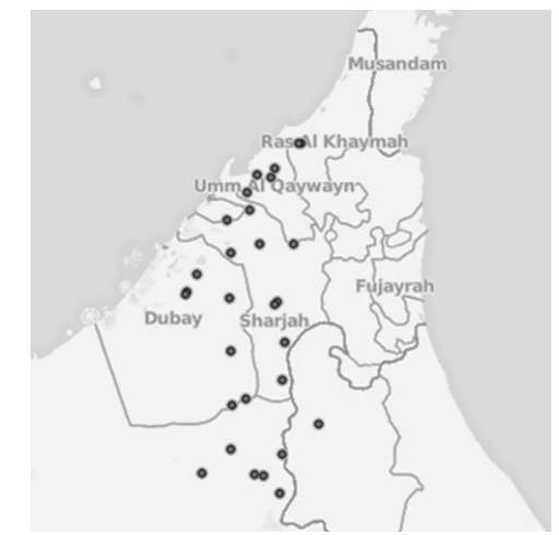
Fig. 2. Citrullus colocynthis germplasm collection sites.

followed by incubation at room temperature. This suggests that seed dormancy in C. colocynthis could be attributed to both mechanical and bio-chemical factors. It is possible that the seed contains certain inhibitory factors that need to leach out (for which the seed coat breach and soaking is necessary) in order for germination to occur. The temperature requirement is in keeping with the plants natural environment.